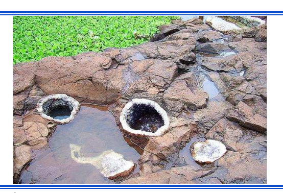
Semi precious stones