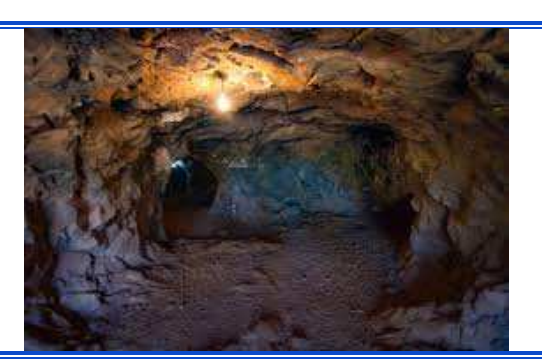
Mines in Wanda