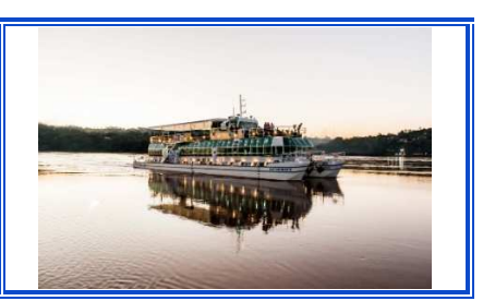
Katamaram II with dinner at sunset